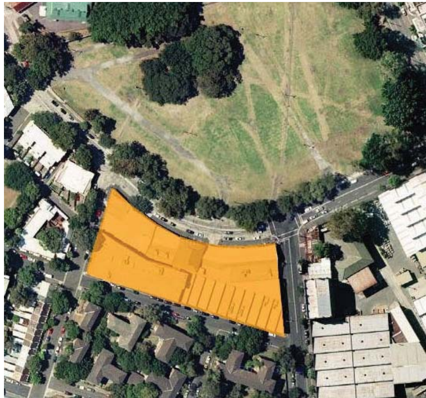
Figure 1: Proposed development location and site area

The proposed development is looking at implementing environmental and social integration by developing effective design initiatives which will add value to the existing district and community.